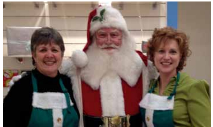
Gift Wrapping, Denim Do, the Pumpkin Run, Pumpkin Days and the Golden Ears Run were just some of the events hosted by our Community partners that raised almost $50,000 for the foundation in 2011.